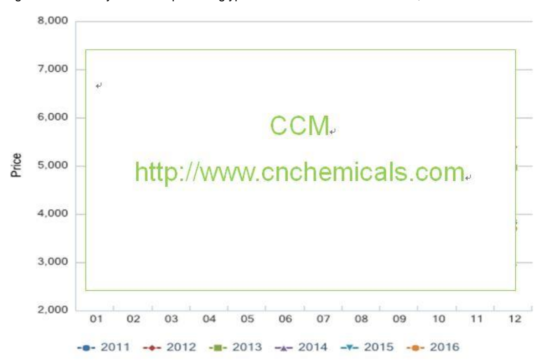
Figure 2-2 Monthly ex-works price of glyphosate 95% technical in China, Jan. 2011-Dec. 2016