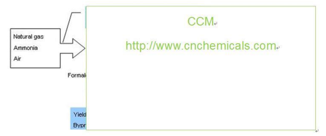
Figure 1.1-1 Production process of IDAN by natural gas route in China